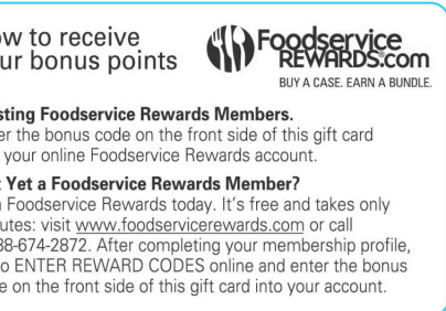
Standard Card Front & Back