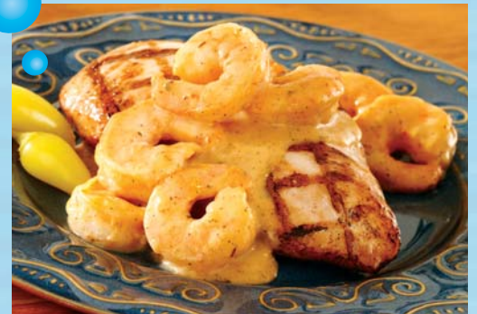
Roasted Garlic & Herb SauceSations® Over Chicken

W ith an unbeatable selection of delicious seafood and an endless supply of tantalizing menu ideas, King & Prince and Mrs. Friday's help you Make Menu Magic™ and boost your margins. Plus, enter your rewards codes for qualifying products between June 1 thru August 31 and earn up to 10,000 additional Foodservice Rewards® points.