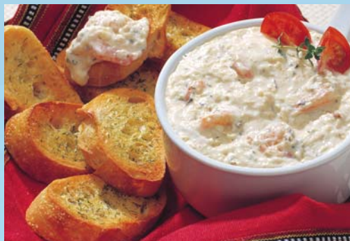
Shrimp, Crab & Parmesan Dip

W ith an unbeatable selection of delicious seafood and an endless supply of tantalizing menu ideas, King & Prince and Mrs. Friday's help you Make Menu Magic™ and boost your margins. Plus, enter your rewards codes for qualifying products between June 1 thru August 31 and earn up to 10,000 additional Foodservice Rewards® points.