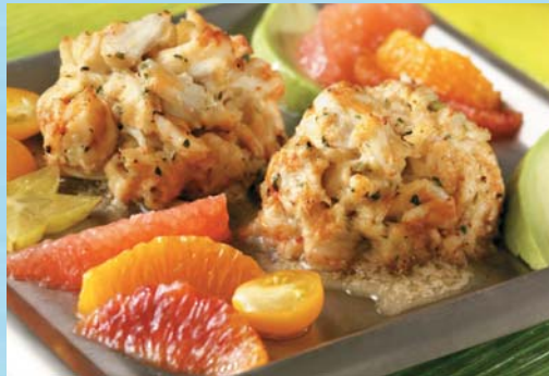
Gourmet Crab Cakes