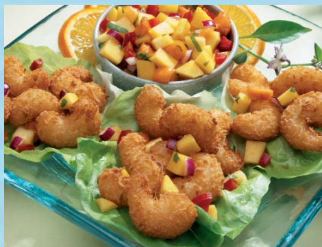
Maui Munchers Popcorn Shrimp