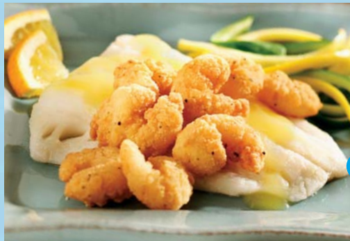
Buttermilk Popcorn Shrimp Over Tilapia