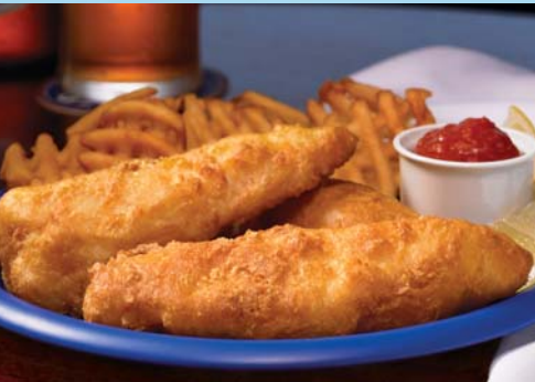
Beer Battered Fish (made with Sam Adams®)