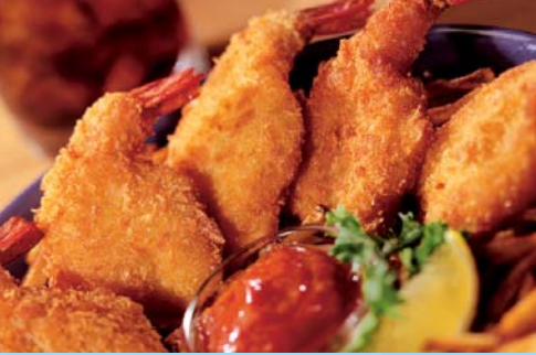
Premium Dinner Shrimp