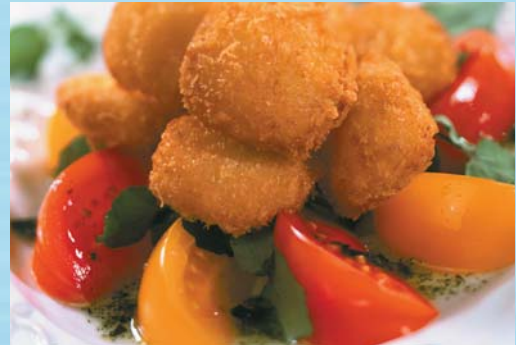
Scallops Tomato Salad

In addition to the increasing consumer demand, seafood offers extensive menu flexibility that's perfect for lighter, summer fare. From fish tacos, that rank in the top 5 hottest trends 4 , to endless gourmet crab cake applications, King & Prince and Mrs. Friday's provide hundreds of recipes and serving suggestions to make seafood a red-hot seller on your summer menu.