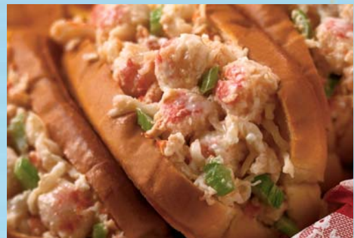
Lobster Sensations ® Roll